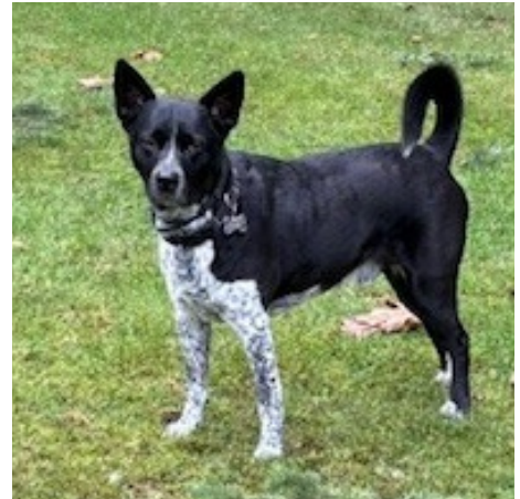
Atlas, formerly known as Moose

I love having a big yard to run around and play fetch the tennis ball. I have a comfy spot on the couch, take long walks and go on hikes. I also like camping and boating with my family and playing with my best doggy friend Ellie. I am still working on my separation anxiety which is really hard but I am grateful I am not left alone very often. They tell me I am handsome, smart and have good manners. I have lots of nick names like best buddy, goof ball, sweet boy, and cuddle bug. I love it most though when they tell me “I love you” and give me a kiss and scratches under my collar.