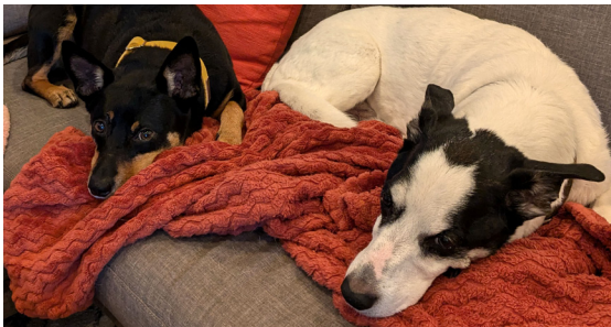
Spike and Timber (formerly Blueberry)

“My husband and I wanted to share a happy tail on Spike and Timber (formerly Blueberry).